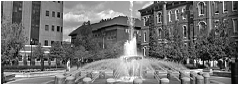
Purdue University Campus -- Mall Area